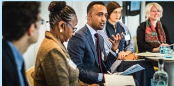
▲ Panel debate at the 10th Anniversary conference in April 2018