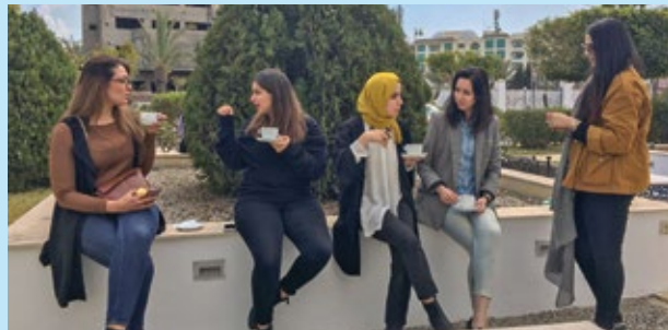
▼ Empowering Libyan women in the diaspora.