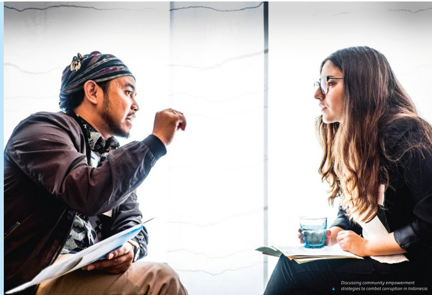
▲ Discussing community empowerment strategies to combat corruption in Indonesia.