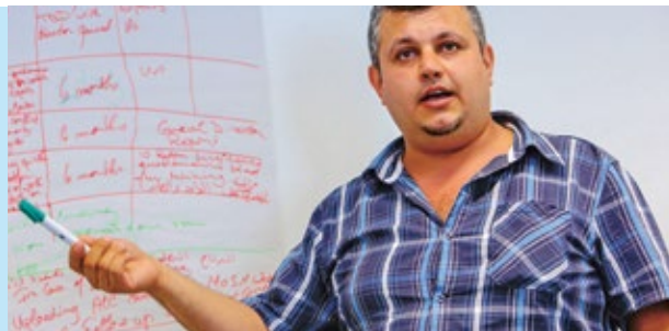
▲ Improving the capacity for service delivery for refugees in Lebanon.

Our online learning network facilitates an exchange of knowledge and experiences long after the training has ended. Here, our alumni report on the results of their action plans, share interesting documents and give each other feedback and support.