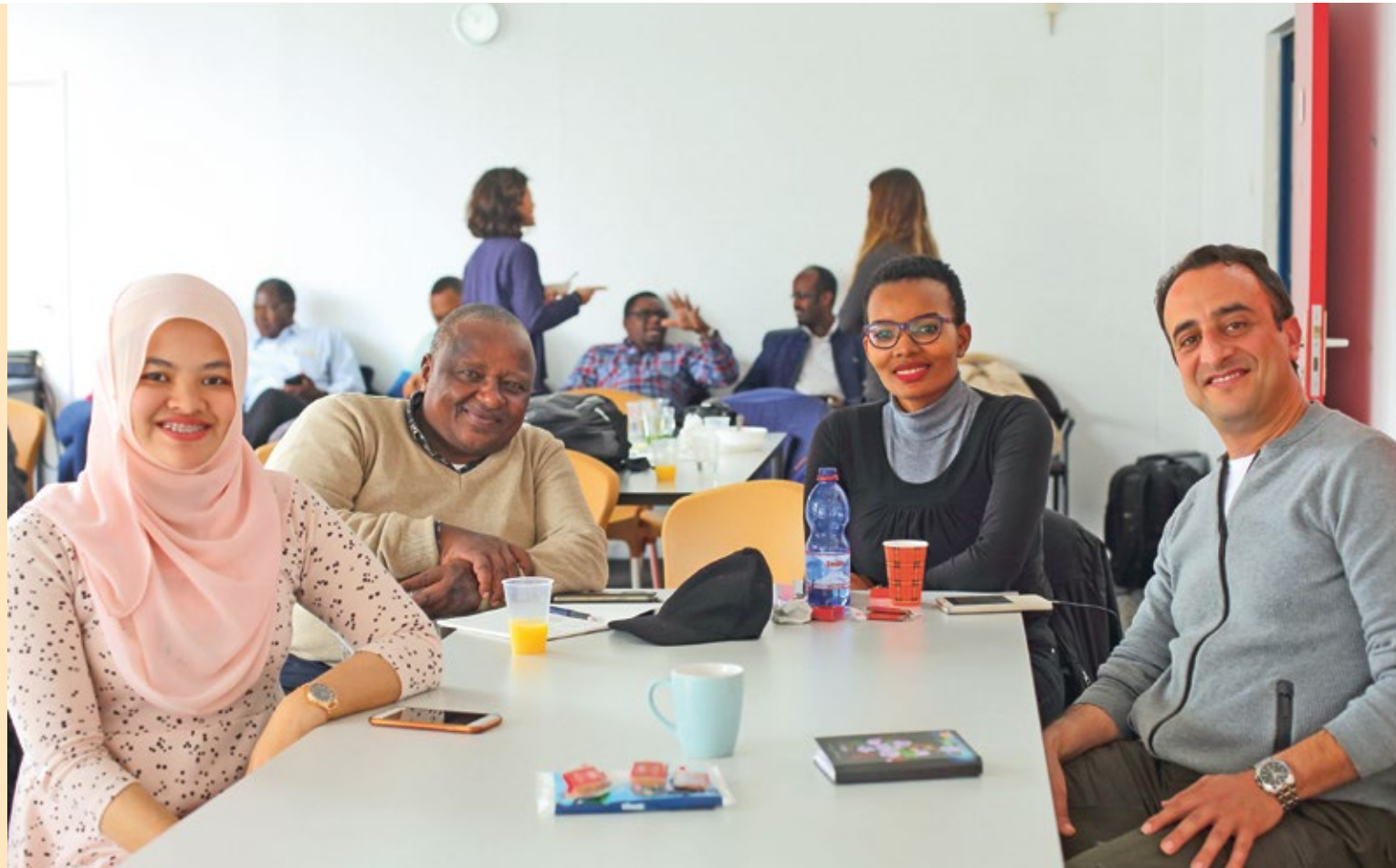
▲ Participants from our Citizen Participation and Inclusive Governance course.

We offer training in English, French and Arabic and we work with local experts who communicate in the language of the participants. Activities are organised both in the Netherlands and in target countries.